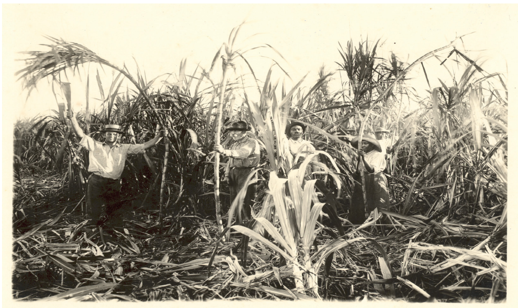
Cutting sugarcane in a field in 1920