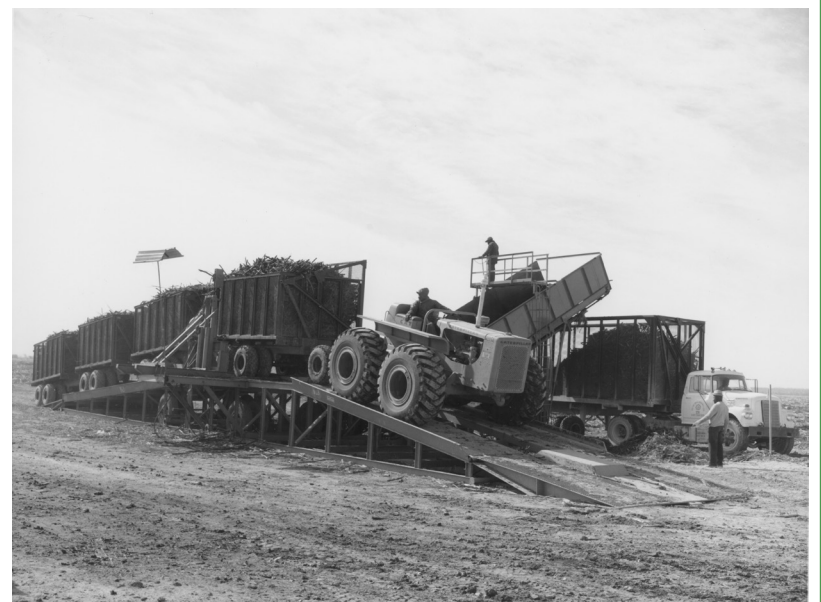
Loading trailers on the Wedgworth Farm