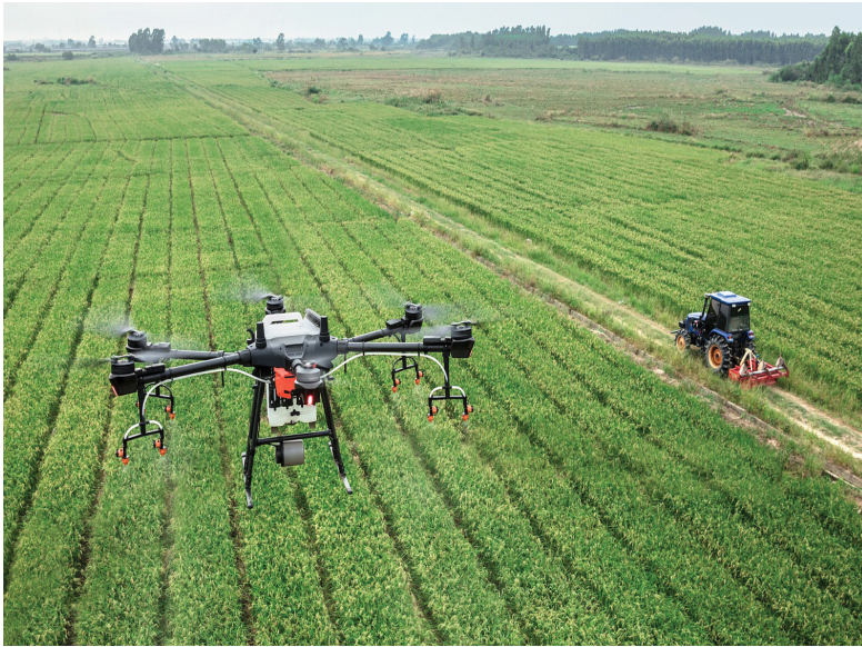
Unmanned aerial vehicle (UAV) gathers images of crops.