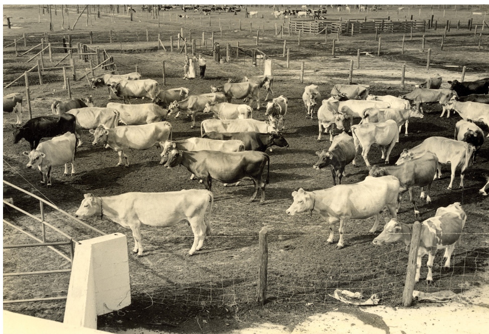
Dairy cows in Florida