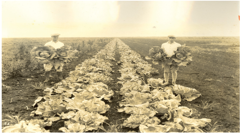
Farmers picking cabbage

Agriculture is very important to everyone. Farmers grow vegetables and fruit, and raise the cows that supply the milk and meat that we drink and eat.