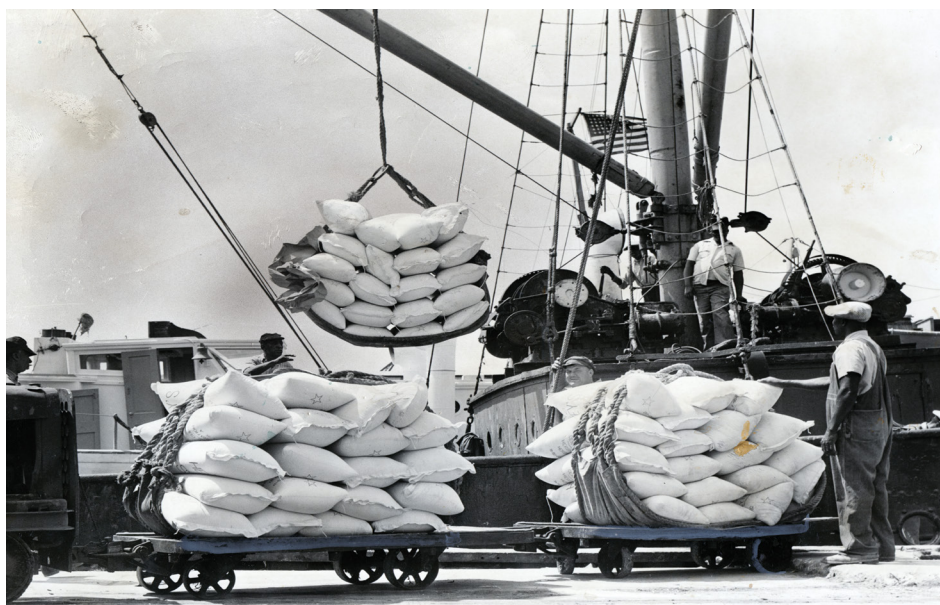
Bags of sugar from U.S. Sugar Corporation in Clewiston, Florida