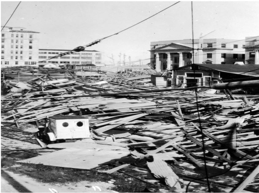
The courthouse after the 1928 hurricane

Hurricanes are important to understanding Florida’s history. On September 16, 1928, a great storm struck Palm Beach County, equal to a Category 4 hurricane. The deadly storm reached the shore with winds of 130 to 150 miles per hour, dropping more than eighteen inches of rain in less than twenty-four hours. This hurricane damaged almost everything in its path. The strong winds and heavy rainfall caused Lake Okeechobee to overflow and flood Belle Glade, Pahokee, South Bay, and Canal Point. The flooding and high winds killed more than 3,000 people in Palm Beach County. Yet the survivors overcame