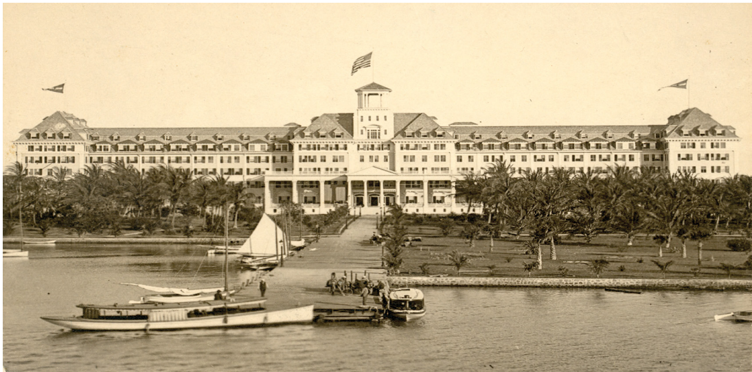
The Royal Poinciana Hotel

Flagler designed a city across Lake Worth to be the commercial and residential area to support the resort. This west side community incorporated as West Palm Beach in 1894. By then Flagler’s railroad reached the new town, bringing wealthy visitors