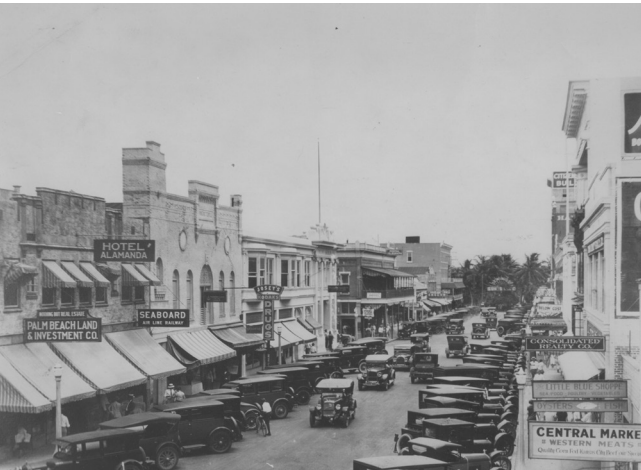
Clematis Street in 1920