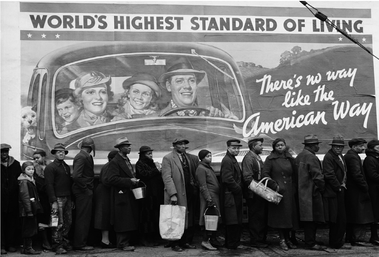
Men, women and children in a relief line during the Great Depression

In addition to these problems, several natural disasters hurt Florida's economy, and the state went into a depression. During an economic depression, people lose their jobs and can't afford to buy what they need. In turn, businesses cannot make enough money. In October 1929, the United States went into the Great Depression when the stock market crashed.