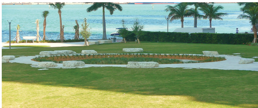
The Miami Circle

The Jeaga lived along the coast of Palm Beach County. Like the Ais, they were hunter-gatherers that ate game animals such as deer. They gathered coco plums, seagrapes, and palm berries. They caught food such as fish, shellfish, and sharks from the sea, freshwater lakes, and rivers. The Jeaga from the village of Hobe, who are sometimes referred to as Hobe Indians, captured the