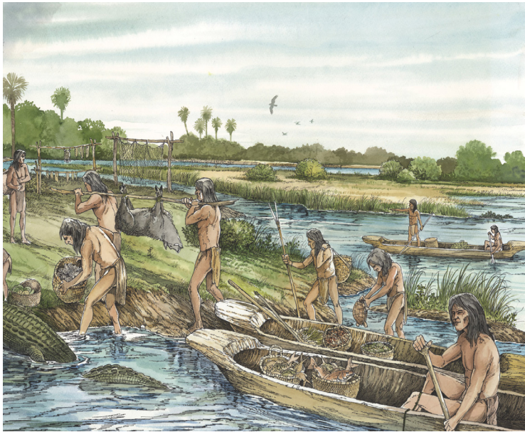
Artist's concept of a Belle-Glade Culture village.

Members of this tribe built their homes on stilts with roofs of palmetto leaves. Like most south Florida tribes, the Calusa did not farm, but hunted animals such as deer. They also fished for mullet, catfish, turtles, and eels and ate shellfish such as conchs, crabs, clams, lobsters, and oysters. The Calusa made shell-pointed spears for fishing and hunting. They used many types of shells, bones, and shark teeth for tools and jewelry.