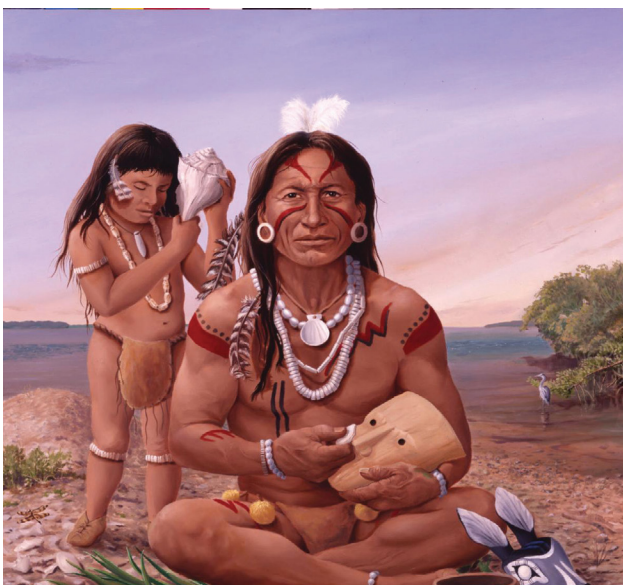
Calusa man carving a mask.

The 1,800-to-2,000-year-old Miami Circle at Brickell Point in Miami was discovered in 1998 when archaeologists investigated the site prior to construction of a multi-story apartment complex. This unique circle has twenty-four large holes and many smaller ones carved into limestone bedrock. The diameter of the circle measures thirty-eight feet. Ceramics, animal bones, shells, and stone axes were part of the approximately 143,000 items discovered in the circle area. It was part of the main Tequesta village on the south side of the mouth of the Miami River. The Miami Circle may have been a council house or ceremonial structure. It is a designated National Historic Landmark and in 2011 opened as a public park. Since its discovery, several more circles have been