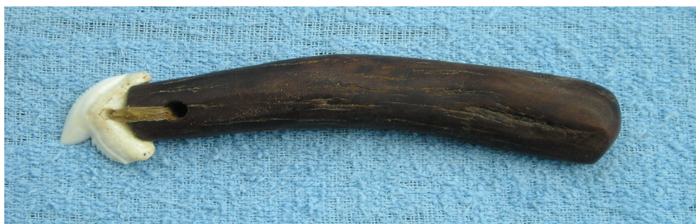
Shark tooth tool

By the eighteenth century, most of Florida’s native tribes were gone from European diseases, warfare, and slavery. They were replaced by groups from Georgia and Alabama, known generally as Seminoles and Miccosukee.