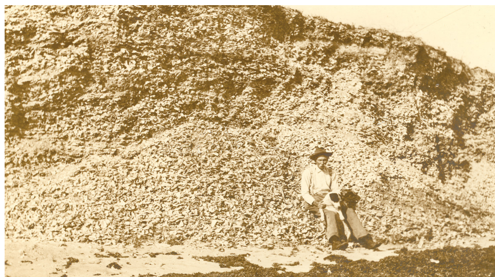
A shell mound in Boca Raton