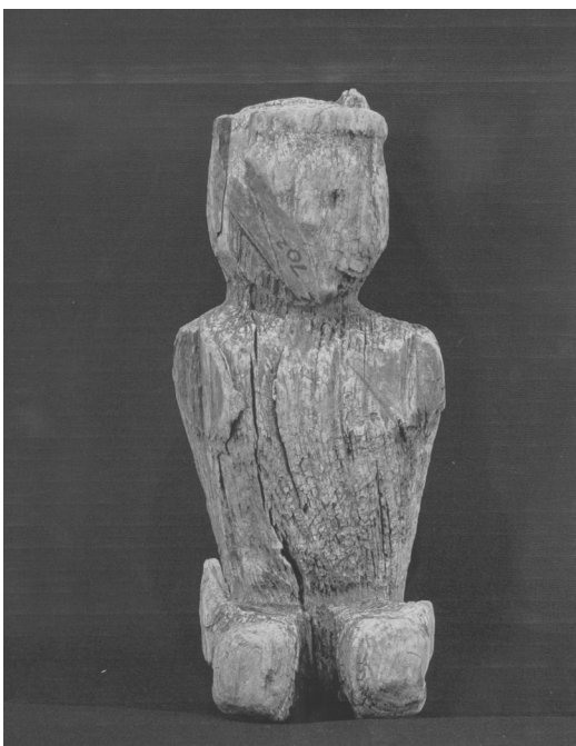
A carved effigy.

In 1928, engineer Karl Riddle discovered a small carved cypress statue while working on road construction near Pahokee, on the east side of Lake Okeechobee. The human effigy is one of only a few found in south Florida and is believed to represent a shaman, leader, or ancestor. Belle Glade Culture artisans were expert woodworkers. Woodworking tools that may have been used to create the figure include shark teeth attached to a wood or bone handle. Early south Floridians also