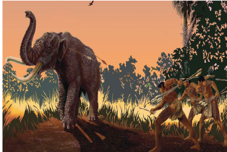
Paleoamericans hunting a mammoth.

Important clues about Florida's ancient people are found in shell mounds created when early tribes ate shellfish and tossed the shells into piles, or mounds. These mounds are also called middens , which are trash or garbage heaps. Other mounds were used for rituals or burials. By researching these mounds and their contents, archaeologists learn about the everyday life of ancient people: what foods they ate, what tools they used, and what other items they made. Sometimes European